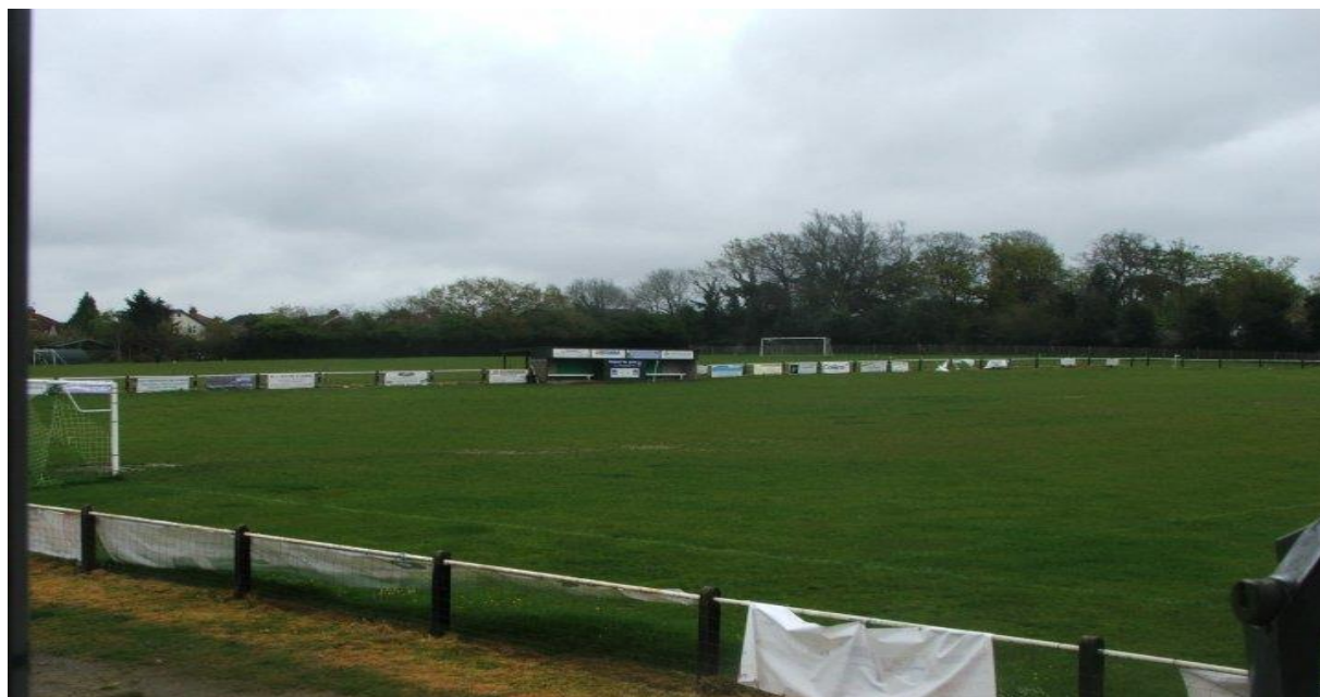
Steve the groundhopper

Take the A21 from the north third exit at the first roundabout first exit at the next and from the south take the second exit at the roundabout and join the A264 then take a right for Rusthall, continue up Rusthall High Street and take a right into Nellington Road where the road bends sharp to the left and the sign for Rusthall Lodge, follow the lane for another 500 yards and the ground will be signposted on your right.